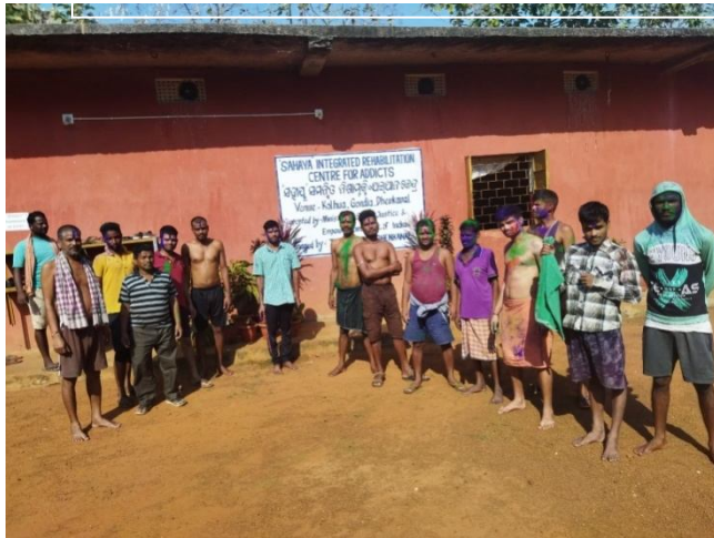
OBSERVATION OF HOLI BY INMATES