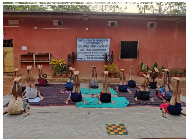
REGULAR YOGA PROGRAMME IN THE SAHAYA CENTRE