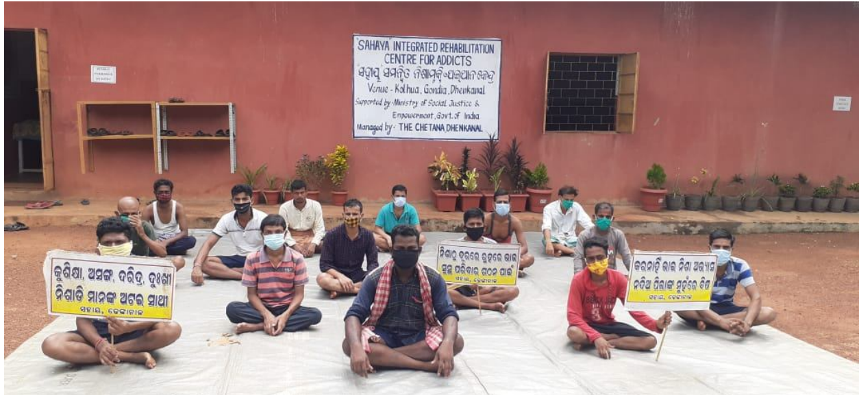
OBSERVATION OF INTERNATIONAL DAY AGAINST DRUG-ABUSE AND ILLICIT TRAFFICKING

Below we submit few service related photographs;