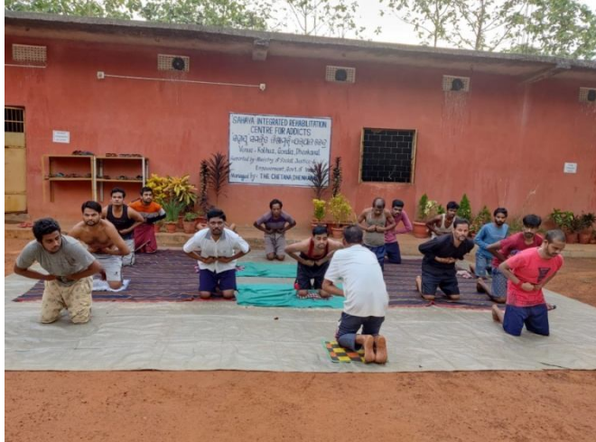
REGULAR YOGA PROGRAMME IN SAHAYA CENTRE