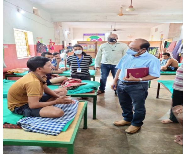
VISIT AND INTERACTION BY DISTRICT OFFICIAL IN THE SAHAYA